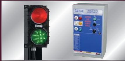
Controls are easily combined with dock leveler controls to integrate entire dock system.