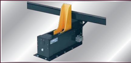
HOLD-TITE™ can be drive mounted or wall mounted.