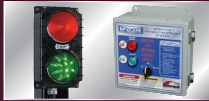
Optional light package and control panel with instructional decal for additional communication safety.