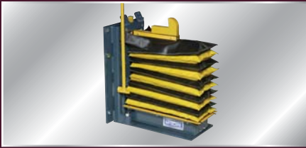
STOP-TITE™ manually operated unit can be set and released easily from the dock with included operate handle.