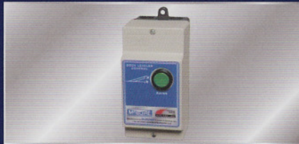
Optional nonmetallic single push button control (non interlock).