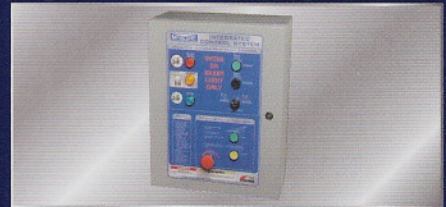
Optional integrated control panel for leveler, restraint, and door. Many other options available.