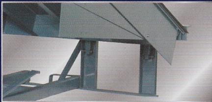
Full width rear hinge in compression with structural channel rear frame supports.